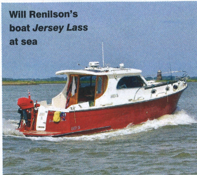
Will Renilson's boat Jersey Lass at sea

All of these simple and very cheap fixes had the same basic aim: to allow this reasonably-sized boat to be handled single-handed in confined spaces. Some of them might work for your boat too.